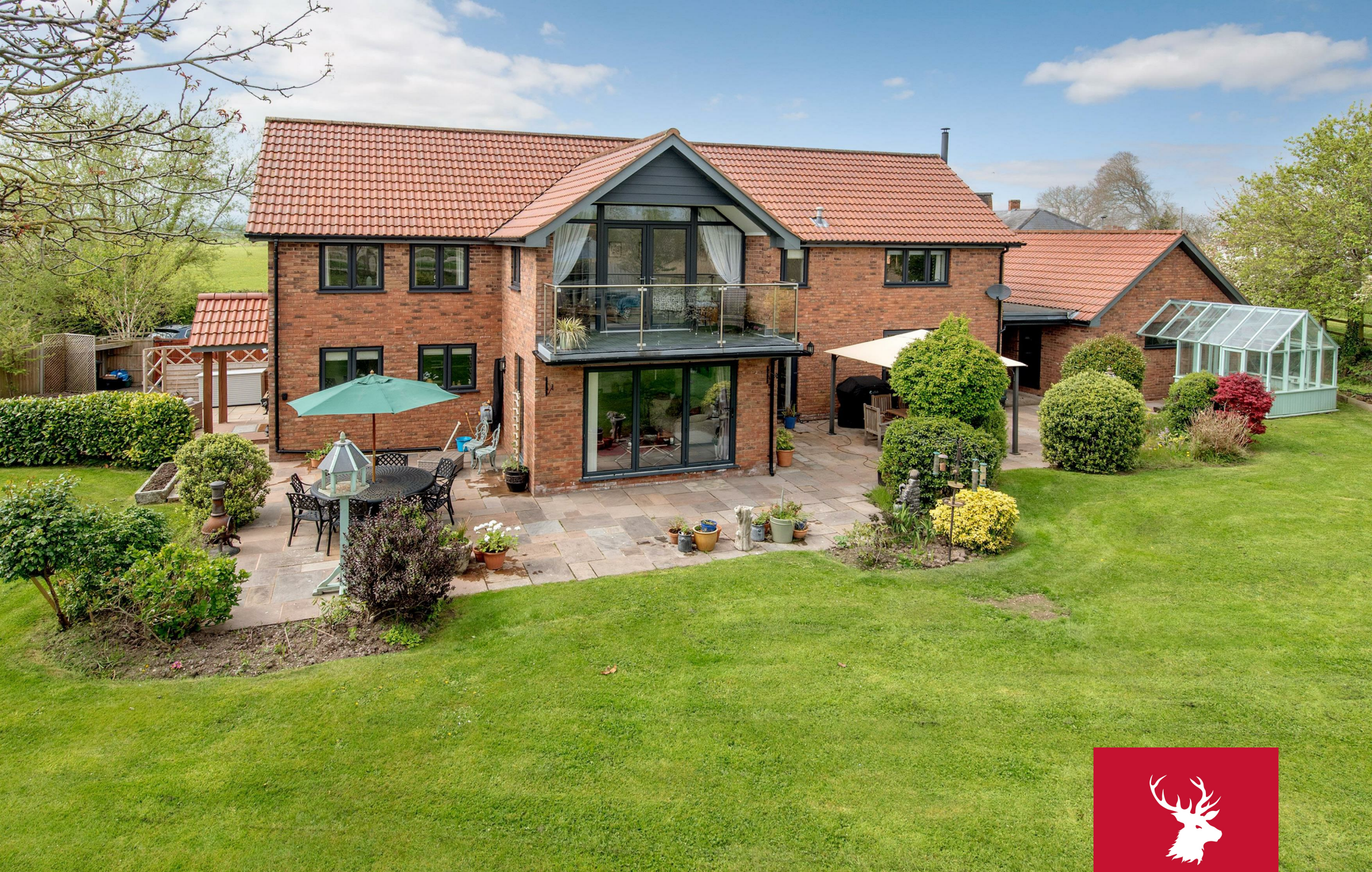
Levelmoor House, Saltmoor